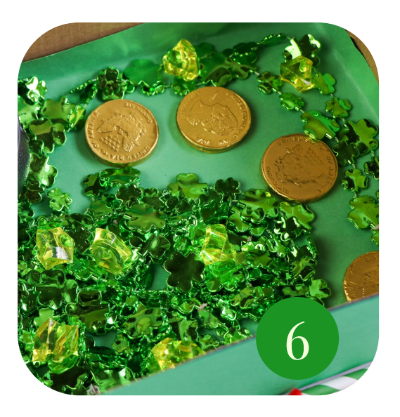
Decorate the inside of the box with toys, beads, candy, and coins.