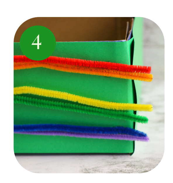
To the front of the shoebox, attach the chenille stems in the color order of a rainbow.