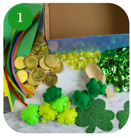
Supplies: Shoebox, green cardstock or construction paper, straw, scissors, glue dots or school glue, chenille stems, 2 large shamrocks, gold coins, and green decorations.