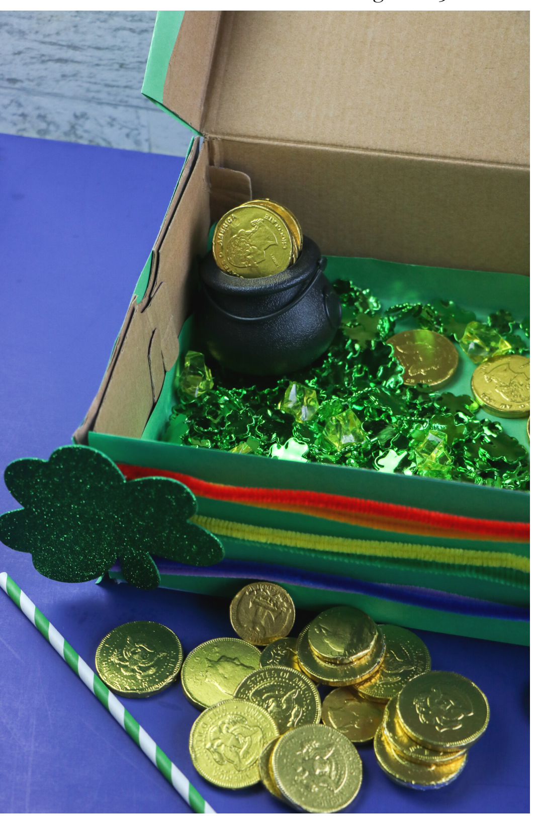
Page 1 of 3