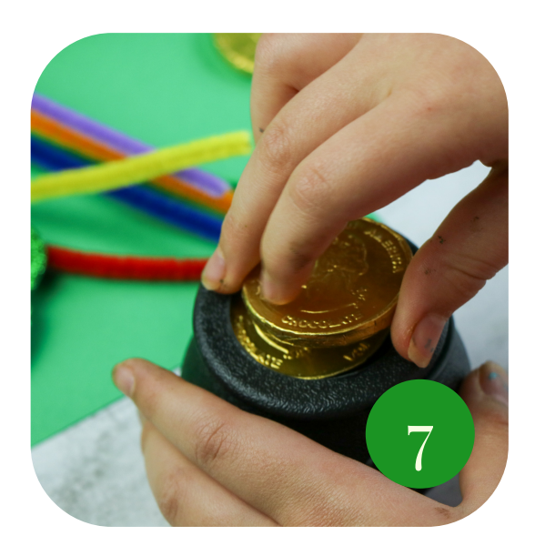
Fill a pot of gold with coins to tempt your leprechaun.