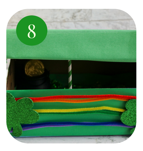
Prop the top of the box open with a straw. Your leprechaun can see inside now.