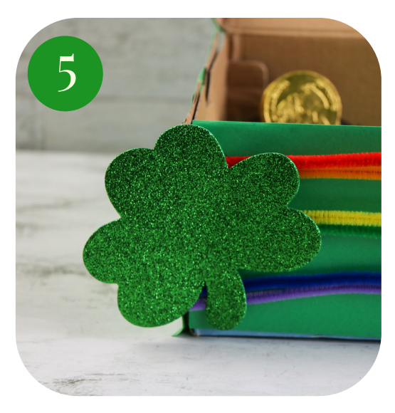
To each side of the chenille stems, glue a large shamrock.