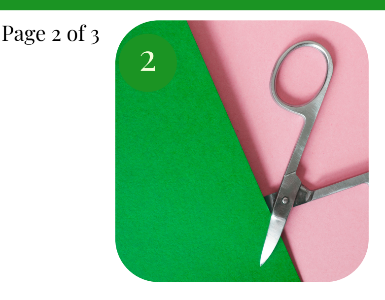
Cut the green paper to fit the inside bottom of the shoebox and attach with glue.