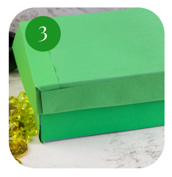
Cut the remaining green paper to fit the outside of the shoebox, completely covering the box, and attach with glue.